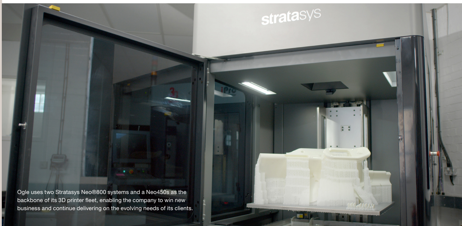
Ogle uses two Stratasys Neo@800 systems and a Neo450s as the backbone of its 3D printer fleet, enabling the company to win new business and continue delivering on the evolving needs of its clients.

As part of its constant forward gaze, Ogle was among the first model makers in the UK to recognize that 3D printing was going to revolutionize the way models and prototypes are created. With the emergence and rapid development of computer aided design (CAD) software, designs moved from drawing boards to motherboards and a fully digital design process started to make sense. In 1996, Ogle invested in its first stereolithography (SL) machine and has been 3D printing ever since.