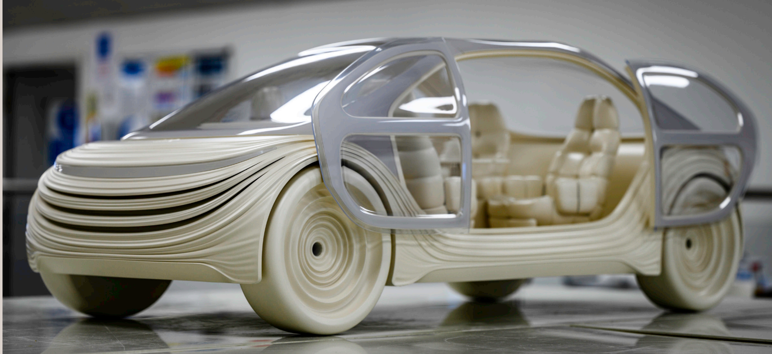
As part of a recent commission by IM Motors, Ogle produced a 1200mm-long model of a visionary all-electric concept car for Heatherwick Studios, created entirely with Stratasys' SL technology.